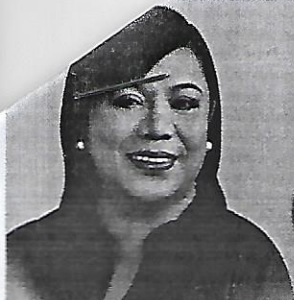
HON. BONA FE DE VERA-PARAYNO MUNICIPAL MAYOR

Republic of the Philippines Province of Pangasinan