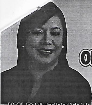
HON. BONA FE DE VERA-PARAYNO MUNICIPAL MAYOR

Tel. Nos.: (075) 540-2400/01/02 • Telefax: 523-6168 / 523-7894