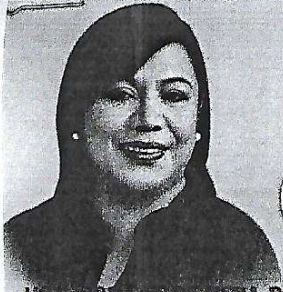
HON. BONAFIDE DE VERA-PARAYNO MUNICIPAL MAYOR

Republic of the Philippines Province of Pangasinan