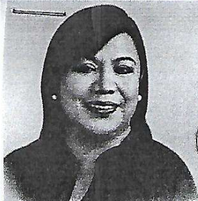
HON. BONA FE DE VERA-PARAYNO MUNICIPAL MAYOR

Republic of the Philippines Province of Pangasinan